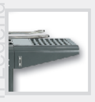
Light touch roller switch in pack table for centering