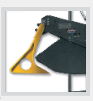
Patented kicker adjustment is automatic