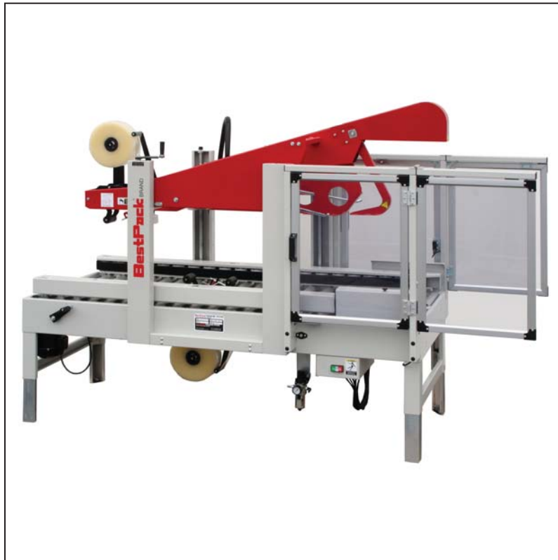
AS Automatic Uniform Sidedrive

The BestPack® AS series are standard operator-free, carton-sealing machines designed to meet the needs of uniform in-line carton closure applications.