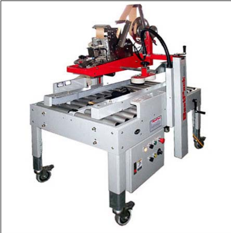
MSD-WA Manual Side Drive Water Activated

The BestPack® MSD22-3WA Series are water-activated (gummed tape), operator fed, adjustable carton-sealing machines designed to cater to the needs of general and heavy duty uniform closure applications.