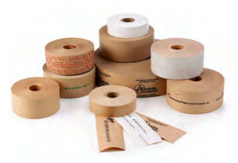
Better Pack Tape,<sup>™</sup> available in a wide range of SKUs