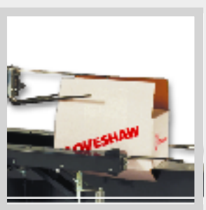
Universal folding bar folds the bottom flaps