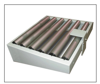
Infeed/Exit Conveyor w/ Stabilizer