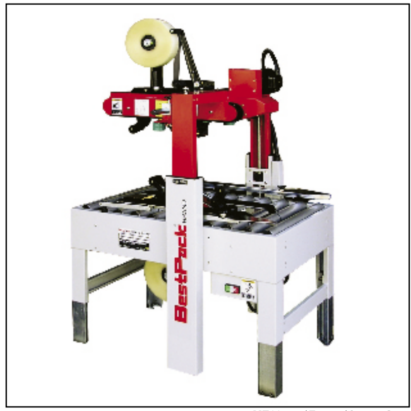
MT Manual Top and Bottom Drive