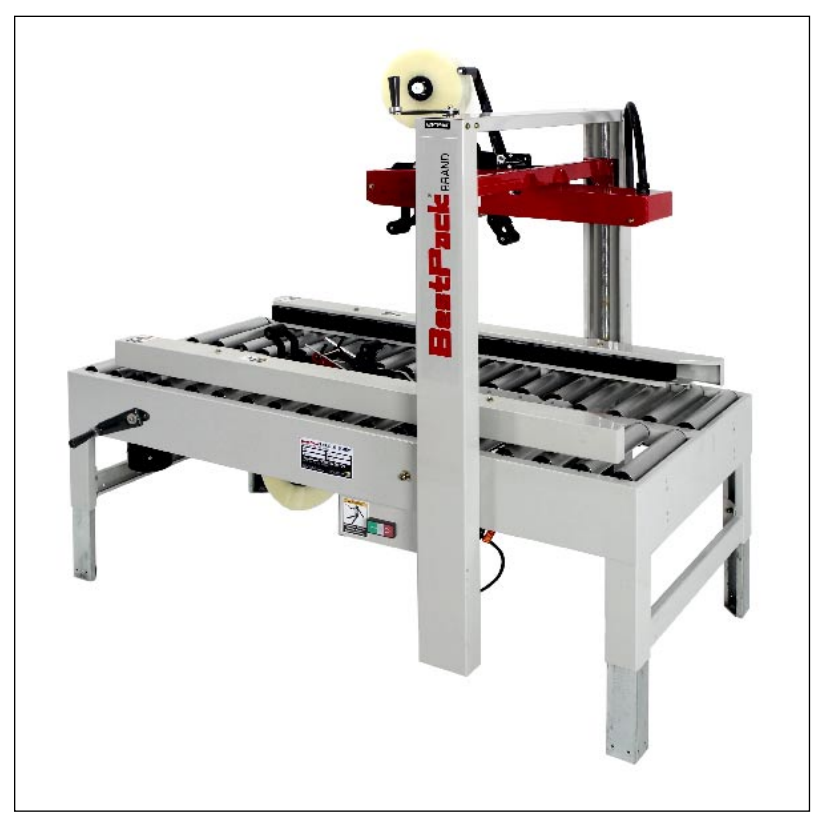
MSL22 Manual Side Drive Low Profile