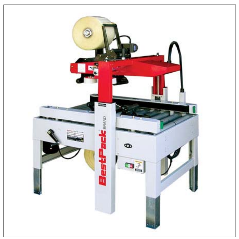
MSD22 Manual Side Drive