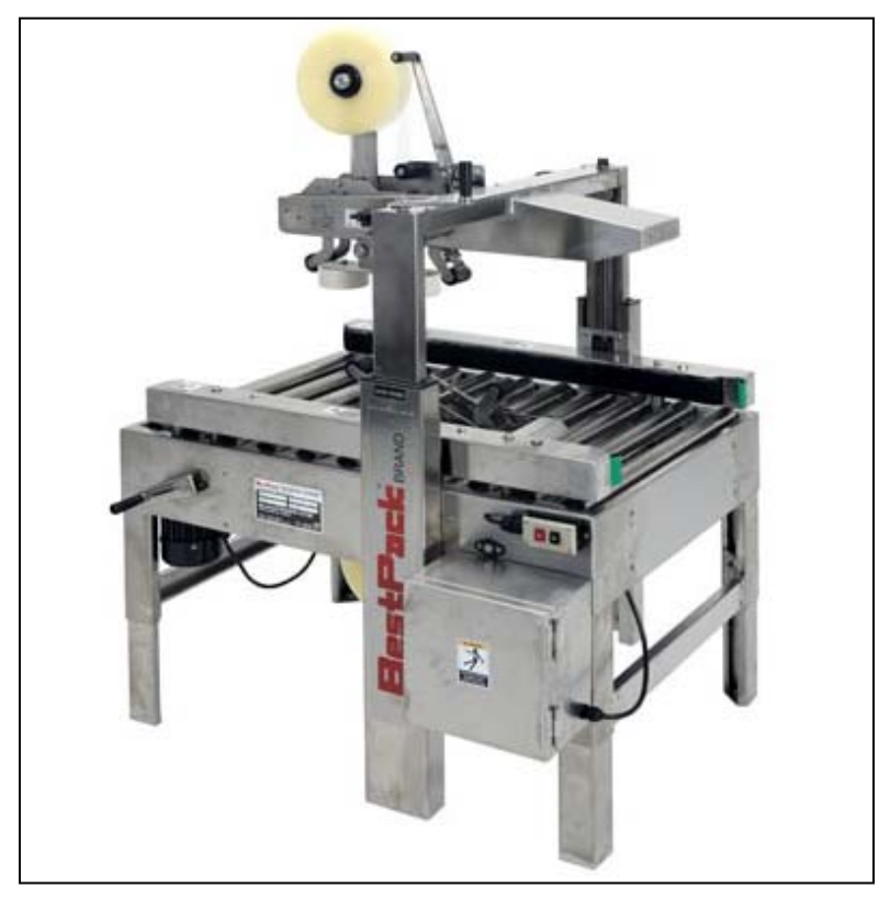
MSD-S 22 Manual Side Drive